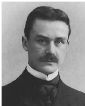
Thomas Mann, photographed in 1900.