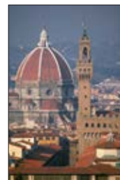
sample pages from the new Blue Guide Concise Italy, April 2009