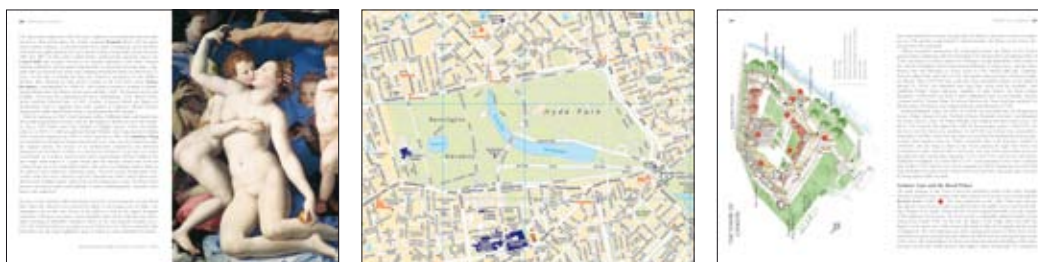
sample pages from the new Blue Guide Museums & Galleries of London, September 2005