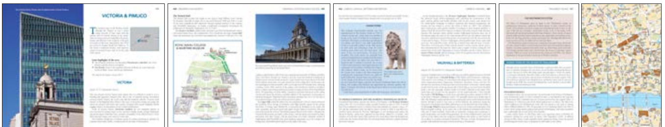
Sample pages from the new Blue Guide London