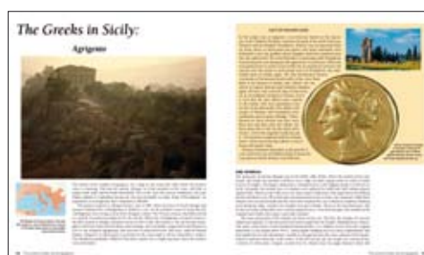
Draft pages from Sites of Antiquity